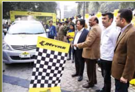
CCI-JK Tyre rally Ministers, MPs drive for road safety