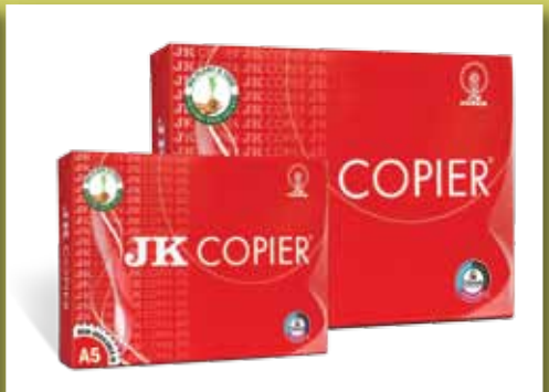
A first in Indian market JK Paper launches A5 sized copier paper