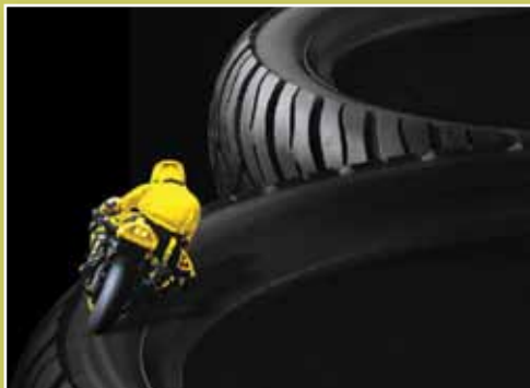
JK Tyre launches Blaze Enters 2-3 wheeler market in a big way