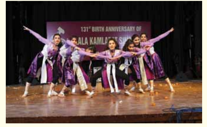
JK Organisation employees and their kin put up a fantastic cultural show on the occasion