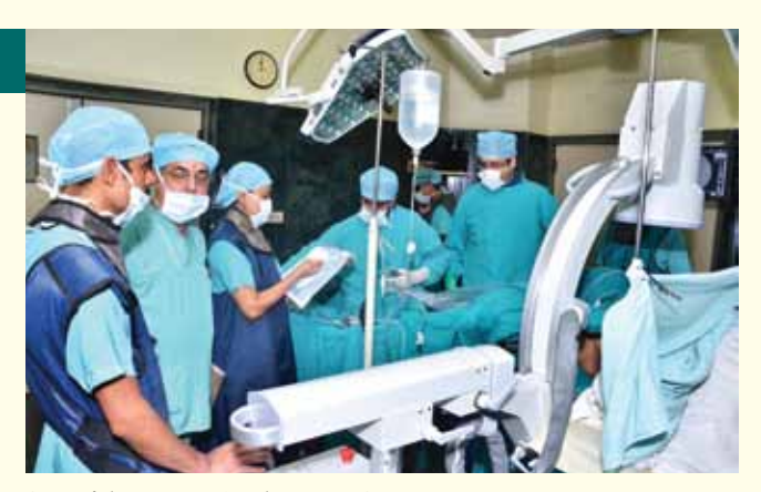
State-of-the-art operation theatre at PSRI

Transplant coordinator at PSRI explained to them that the procedure was very much possible and that PSRI is well equipped and experienced to carry this out satisfactorily as similar cases were handled in the past.